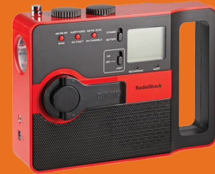
Crank Radio (NOAA)