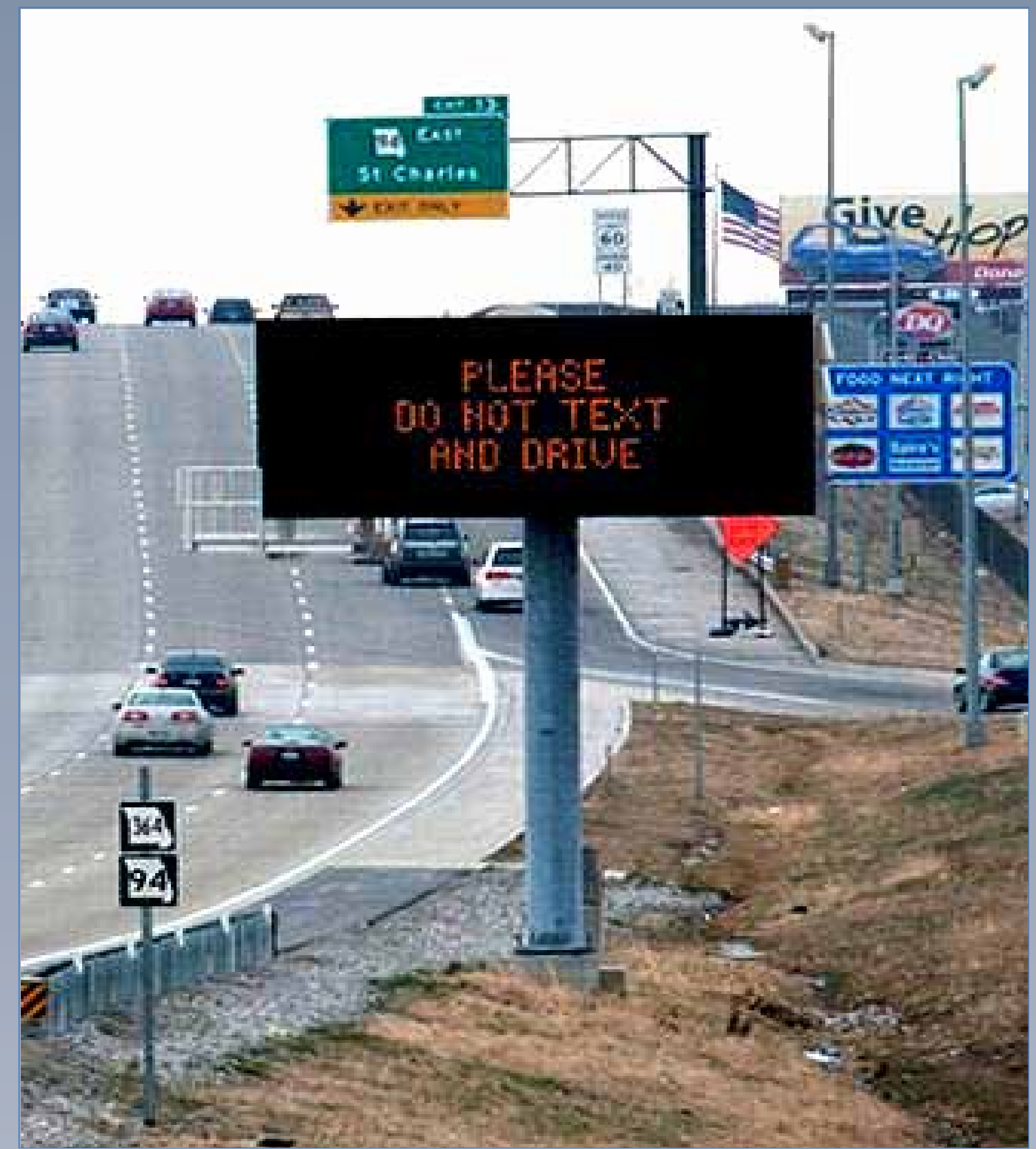
Changeable Message Board

Kansas City Scout – a system used to monitor and respond to traffic incidents and provide roadway information to motorists in the metropolitan area. This is primarily done with changeable message boards that provide real-time information to the motorists along major facilities.