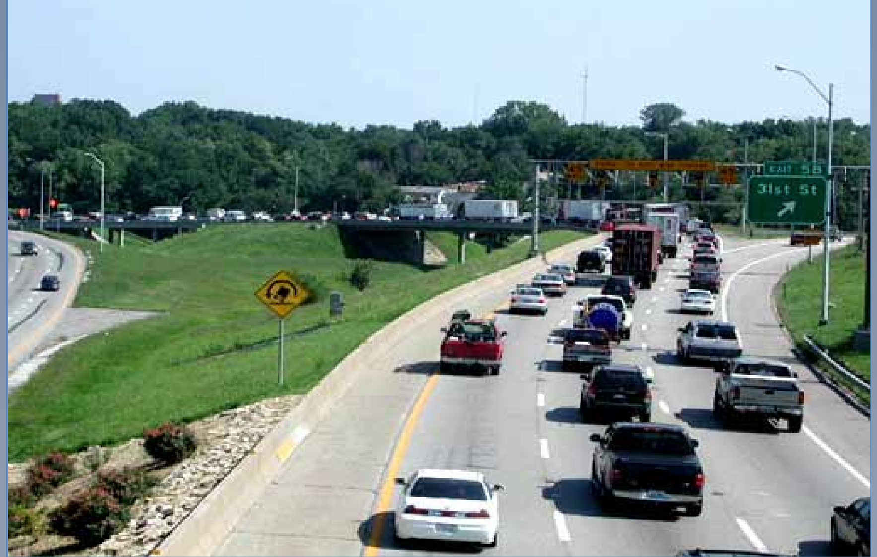
Congestion along I-70 at the Jackson Curve

Bottleneck – section of road that experiences congestion at a specific point; it can be caused by curves, reduced number of lanes, merging traffic, or areas where the number of vehicles exceeds the capacity of the roadway.