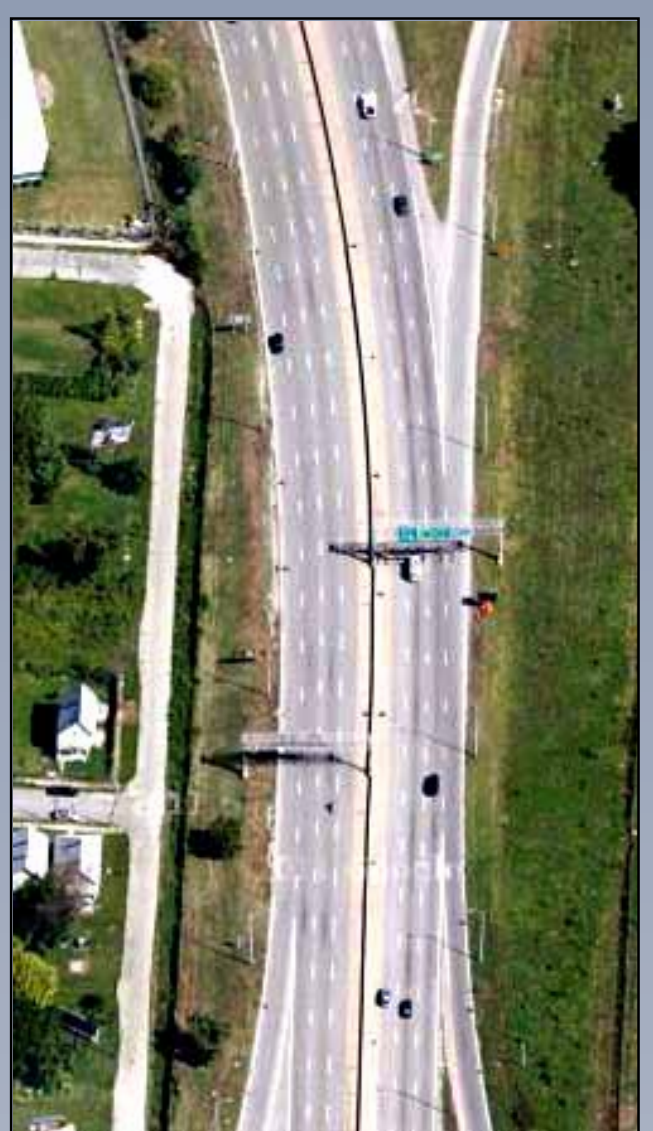
Short Weave Areas