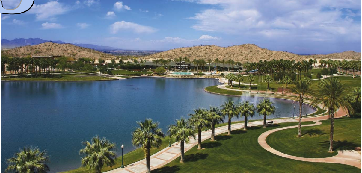
Figure 3.1 Estrella Lakes