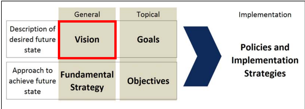
Figure 3.2 Chart showing the building blocks of the General Plan (from Chapter 1). The Vision is highlighted.

This guidance will be carried forward in the General Plan along with the ideas garnered during the extensive public outreach effort which is detailed below.